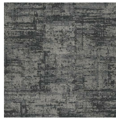
2262 Neutral Density