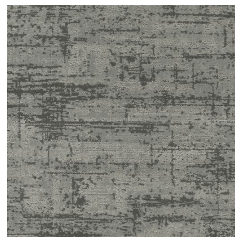
2261 Haze Grey