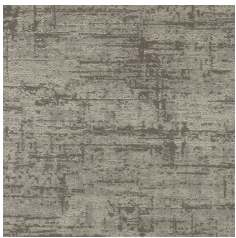
2255 Warm Toned