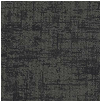
Analog Mono 1822 Modular 1552 Correlate