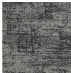
2262 Neutral Density