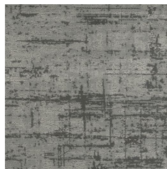
2261 Hase Grey