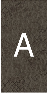
Brookstone 1846 Modular 2920 Grove