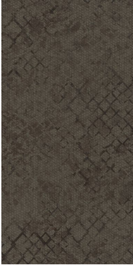
Brookstone 1846 Modular 2920 Grove