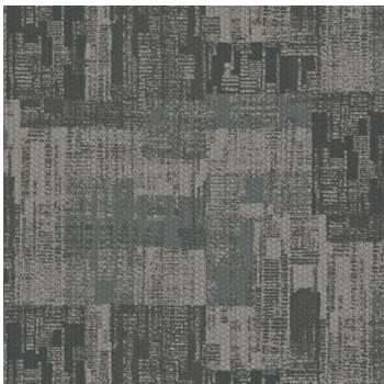
Catalyst 1841 Modular 2842 Motivate