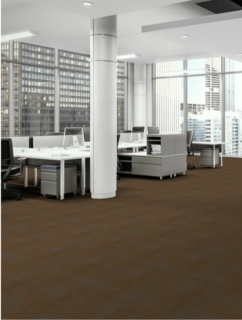
Installation Methods: Brick, Monolithic, Ashlar, Quarter Turn